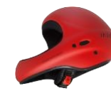
HHe75 softcolor red