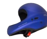
HHe75 softcolor blue