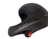
HHe75 softcolor black