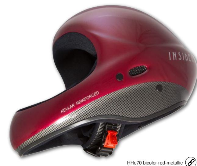
HHe70 bicolor red-metallic

Težina : 650g Veličine : XS (53-54), S (55-56), M (57-58), L (59-60), XL (61-62), XXL (63-65) (head circumf. in cm) XS and XXL only for HHe7 und HHe70