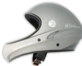
HHe310 anthrazit metallic