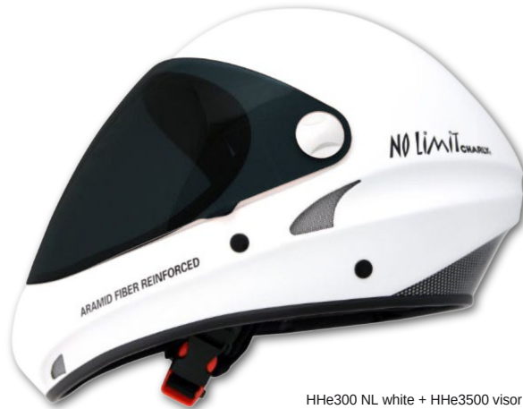
HHe300 NL white + HHe3500 visor