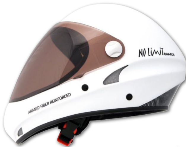
HHe300 white with visor brown tinted

Weight: 650 g + Visier 114 g Sizes: S (55/56), M (57/58), L (59/60), XL (61/62), XXL (63) (Head circumference in cm)