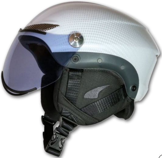
HHe1 white/pearl + HHe11 Visor grey

Basic sizes & weights: S/M = 380 g, M/L = 430 g, XL/XXL = 480 g Scope of delivery: helmet in basic size incl. inlay, without visor