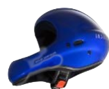
HHe7 unicolor blue