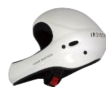
HHe7 unicolor white