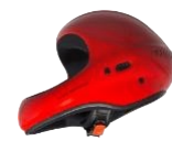
HHe7 unicolor red